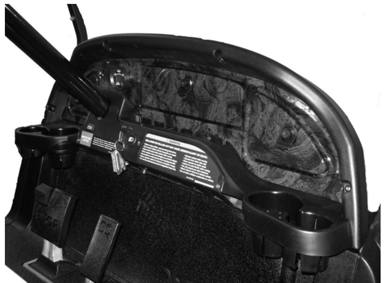
Dash Installed With Trim

Small holes beneath the center compartment door are cut for anchoring the bottom.